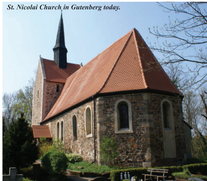
St. Nicolai Church in Gutenberg today.