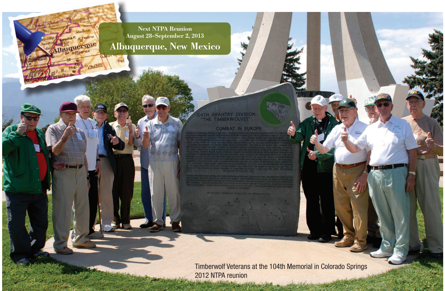
Timberwolf Veterans at the 104th Memorial in Colorado Springs 2012 NTPA reunion