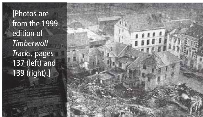
[Photos are from the 1999 edition of Timberwolf Tracks , pages 137 (left) and 139 (right).]

"We were fixing a cup of coffee over our little gas stoves when, all of a sudden, shots rang out..."