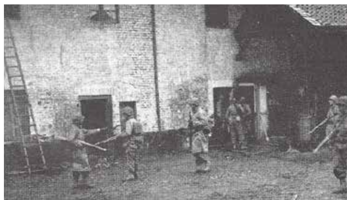
Cautious advance through Eschweiler's sniber-filled streets.