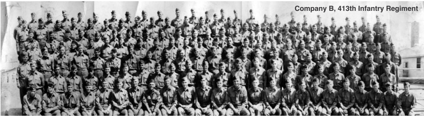
Company B, 413th Infantry Regiment