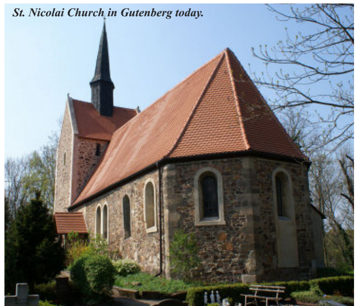
St. Nicolai Church in Gutenberg today.